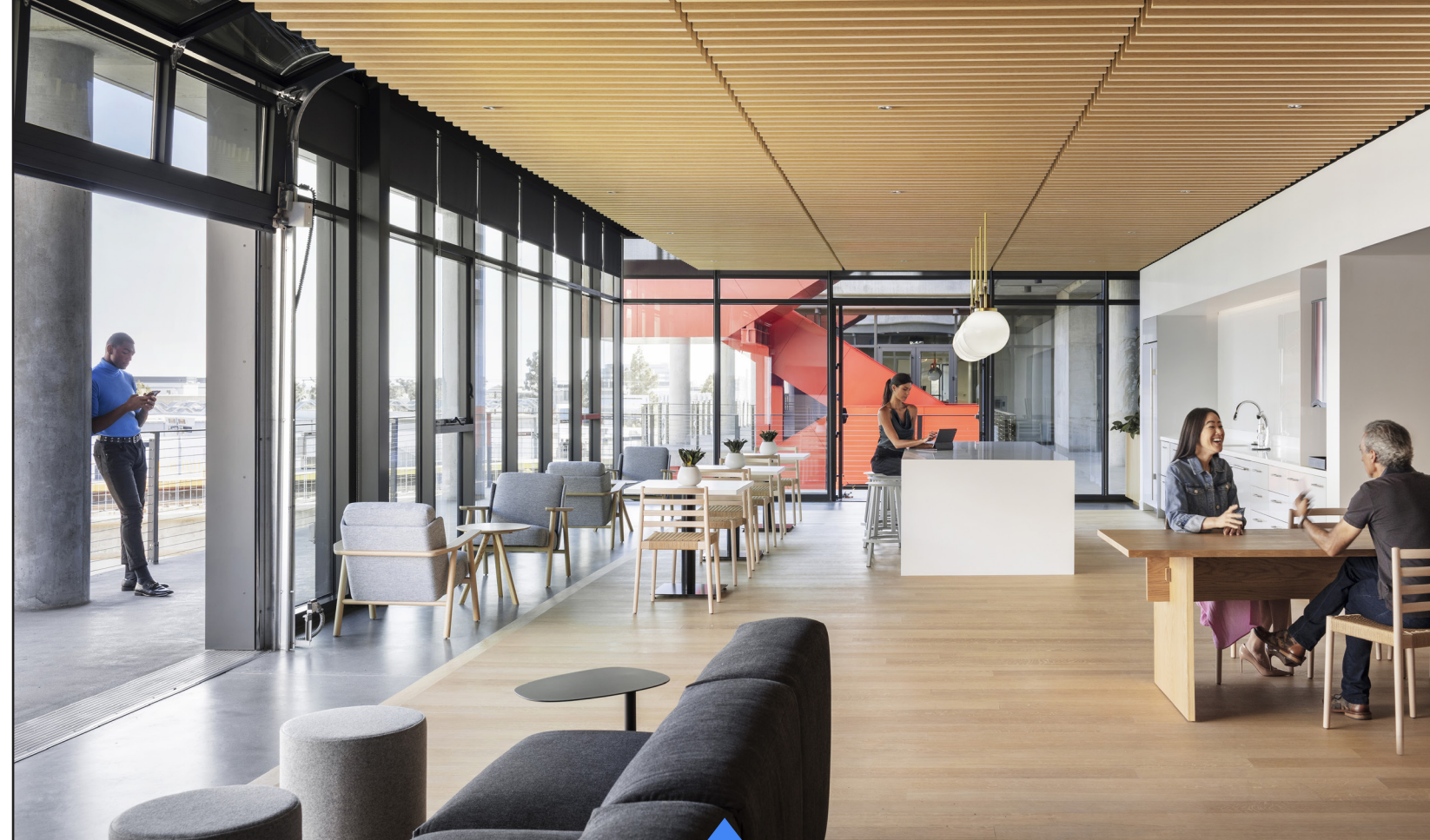
Confidential Client, San Ramon, CA